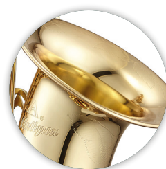
Lacquered brass (LQ)

Finishes: LQ (left), RLQ, CB (right), AQ, BG, CN, BC