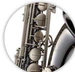
Black and nickel (BC)