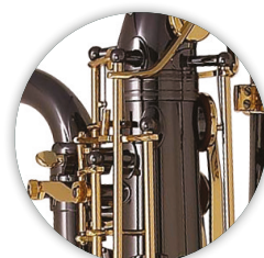
Black and gold (BG)