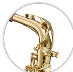
Lacquered red brass (RLQ)