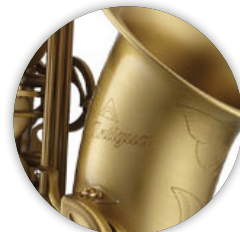
Classic brass (CB)